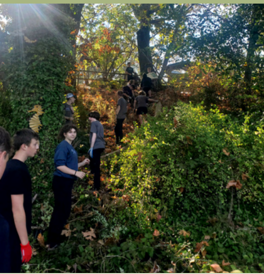
EcoBlitz volunteers assisting with planting efforts