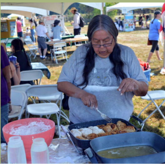
Bannock Station and entertainment at Once Upon a Field Event